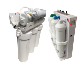
RO5 Models: Back of the unit's bracket. NS-IN Model: Right side panel.